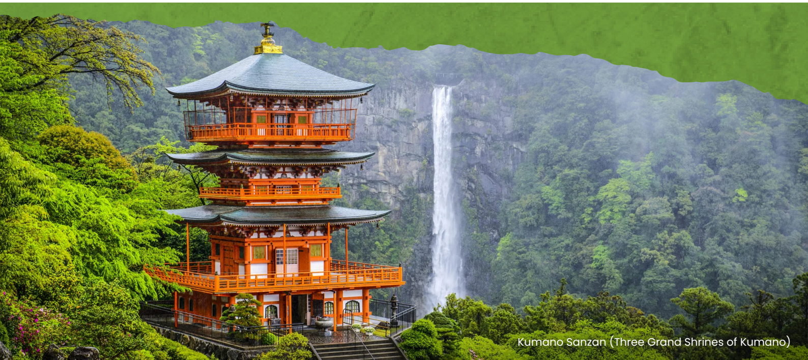
Kumano Sanzan (Three Grand Shrines of Kumano)

The Kii Peninsula, south of Kyoto and Osaka, is a remote, spiritual region home to the Kumano Sanzan (Three Grand Shrines of Kumano). Since the 11th century, emperors have journeyed there via the Kumano Kodo trails. This walk follows the Nakahechi route through forests and villages to the Nachi Grand Shrine. This 14-day Japan tour offers a unique blend of cultural heritage, scenic walking, and city exploration.